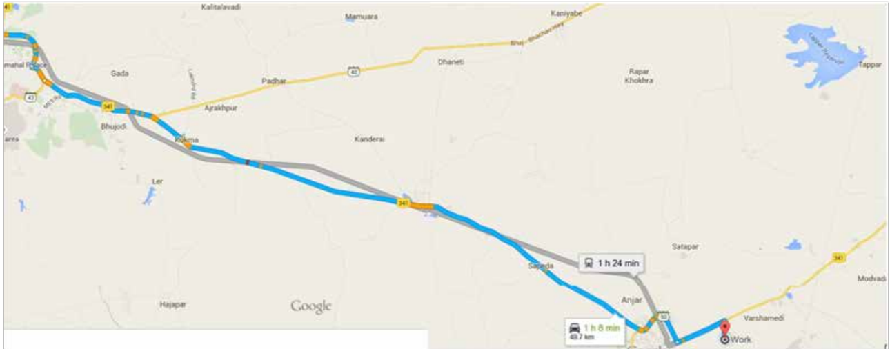
Route Map-Airport to Welspun