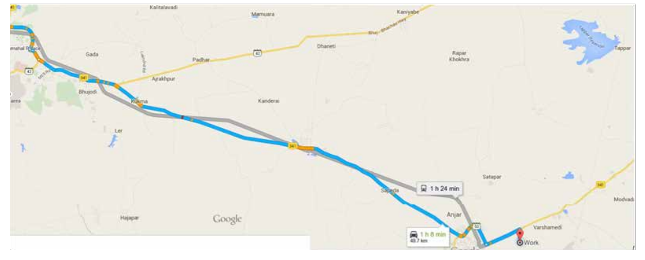
Route Map-Airport to Welspun