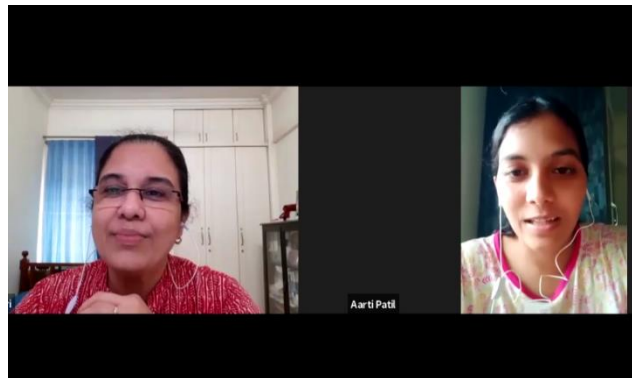
Personalized Personality Development Sessions